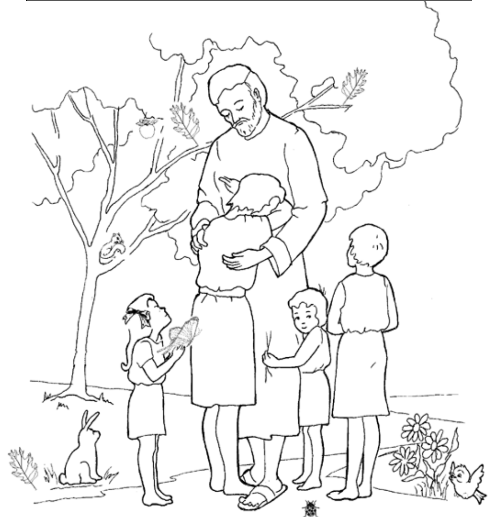
Jesus is Forgiving